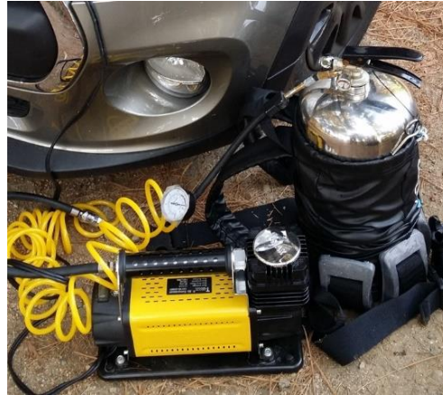
Inflation on a car battery