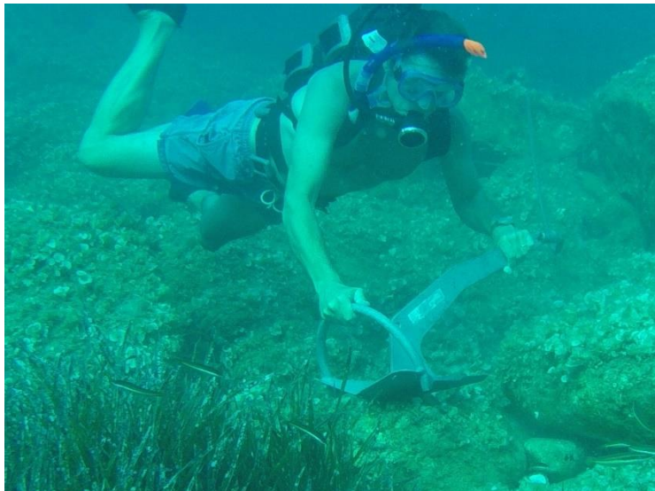
Checking the anchor line