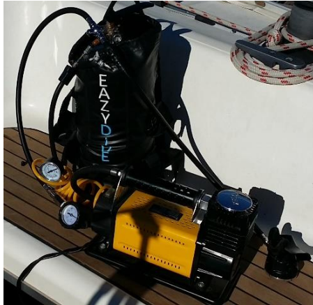
Inflation on board