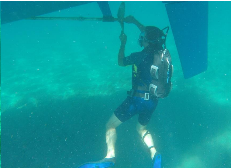
Exit a thread caught in the propeller