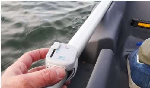
Steering control stick