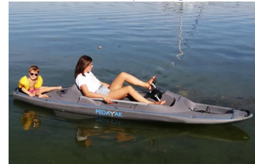
PEDAYAK TRIO ELECTRIC, trimaran